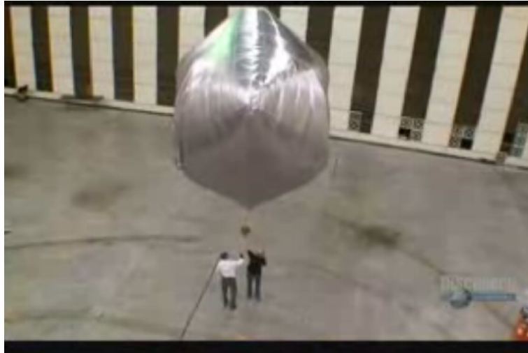
Mythbusters flying their lead balloon (hey, I never said it was small, but neither is our trip!).

You may wonder about the title of this part of the trip. Well, anyone who watches Mythbusters (and if you don't you should, it's a great program) will know that it is possible to make a lead balloon fly, but it is extremely difficult, though hugely satisfying in the end. That's how it feels with this trip. We have a long list of problems we met along the way, had to overcome and now, just before we head off, we are determined to go and have a good time if it kills us (well not quite, but you get the idea).